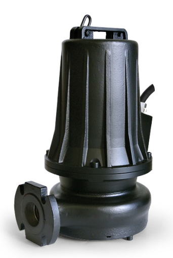
Attention: pictures for illustrative purposes

Tollerance according to ISO 9906:2012 3B2